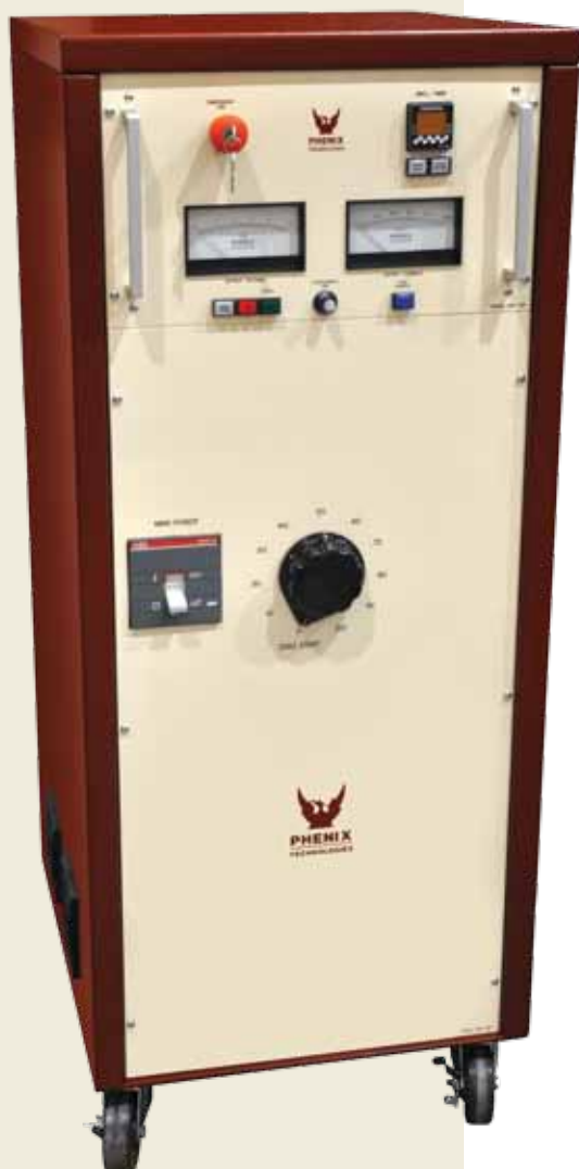
Model 615-7.5P (with dwell timer option)