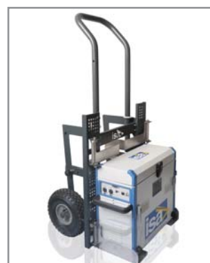
e KAM transport case and trolley