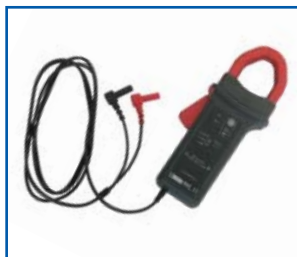
Testing cables and current clamp